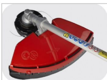
Nylon cutter head